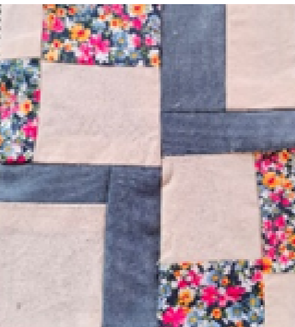
PATCH WORK BY ANUSHA S H BSC