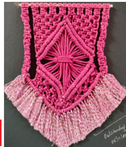
MACRAME ART BY SUSHMA J BSC