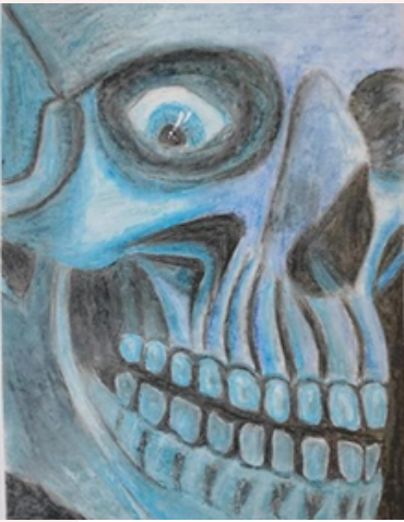
ART BY AYESHA 3RD YEAR BSC