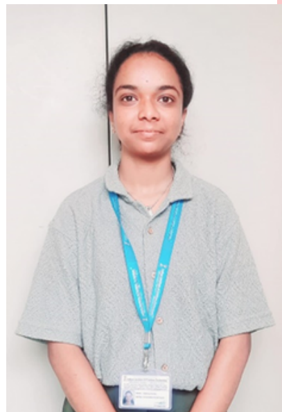
SIDDI RAJU DYNIKA FDBM