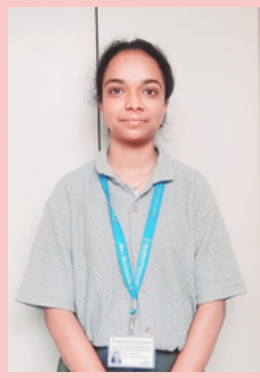
FROM THE EDITOR'S DESK SIDDI RAJU DYNIKA